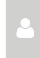
Academic FELLOW Advisory Council STUDENTS